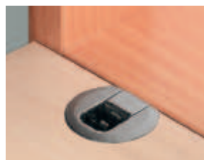
Detail view: Flap made of wood