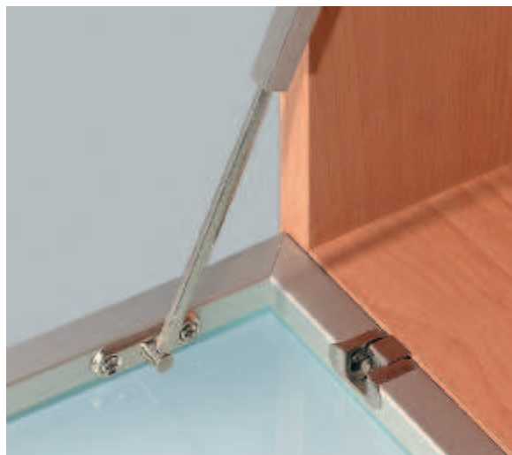
Flap with aluminium frame, application example with Fall-Ex flap stay with braking mechanism