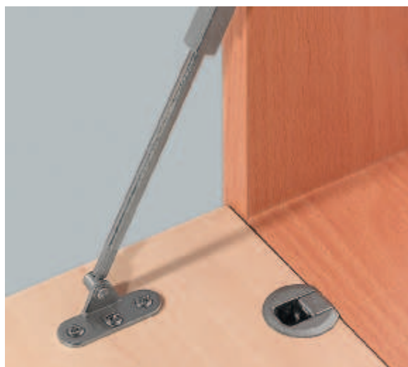
Flap made of wood, application example with Fall-Ex flap stay with braking mechanism